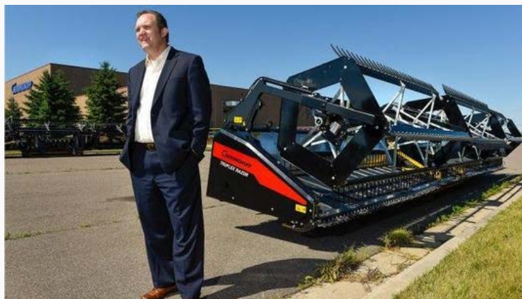
Geringhoff diversifying combine head production Wochit